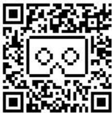
Viewer Profile QR Code

On starting the Cardboard app you will be prompted to scan the QR code below. The same QR code is on the Cardboard VR unit. Scan the QR code and the Cardboard app will configure your phone for the Cardboard 2 VR.